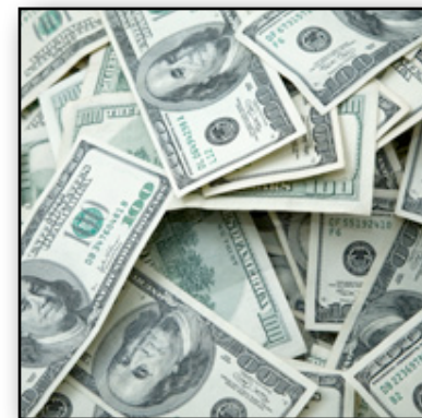
Move from Success to Significance